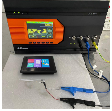
3.2 EFT test