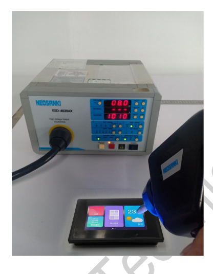
3.1 Electrostatic discharge test

Test process: the product was placed on the test bench to perform contact and air discharge in turn of the serial screen iron frame and display area as shown in Fig.3.1 below. During the experimental process, it was observed whether the screen is dead, black, white, splash, or reboot. According to the experiment results, the performance is in line with the criteria GB/T 17626.2 B level and above.